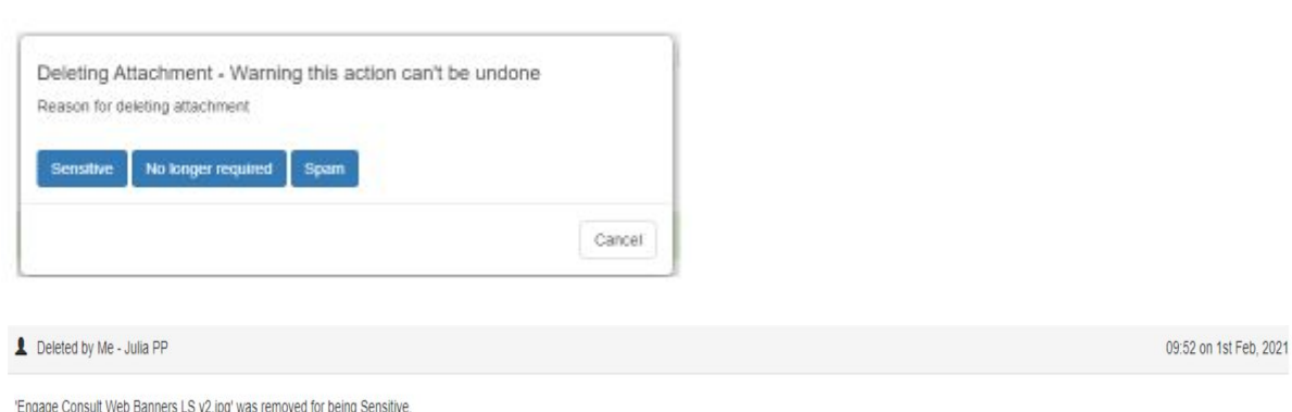
'Engage Consult Web Banners LS v2.jpg' was removed for being Sensitive.

Should staff identify a message that has an attached image or document which they deem inappropriate they now have the functionality to remove it and therefore not attach to the patient record alongside the PDF. For audit purposes, you will be prompted to provide a reason and notes will be added to the request indicating that the attachment was removed, by who, and when.